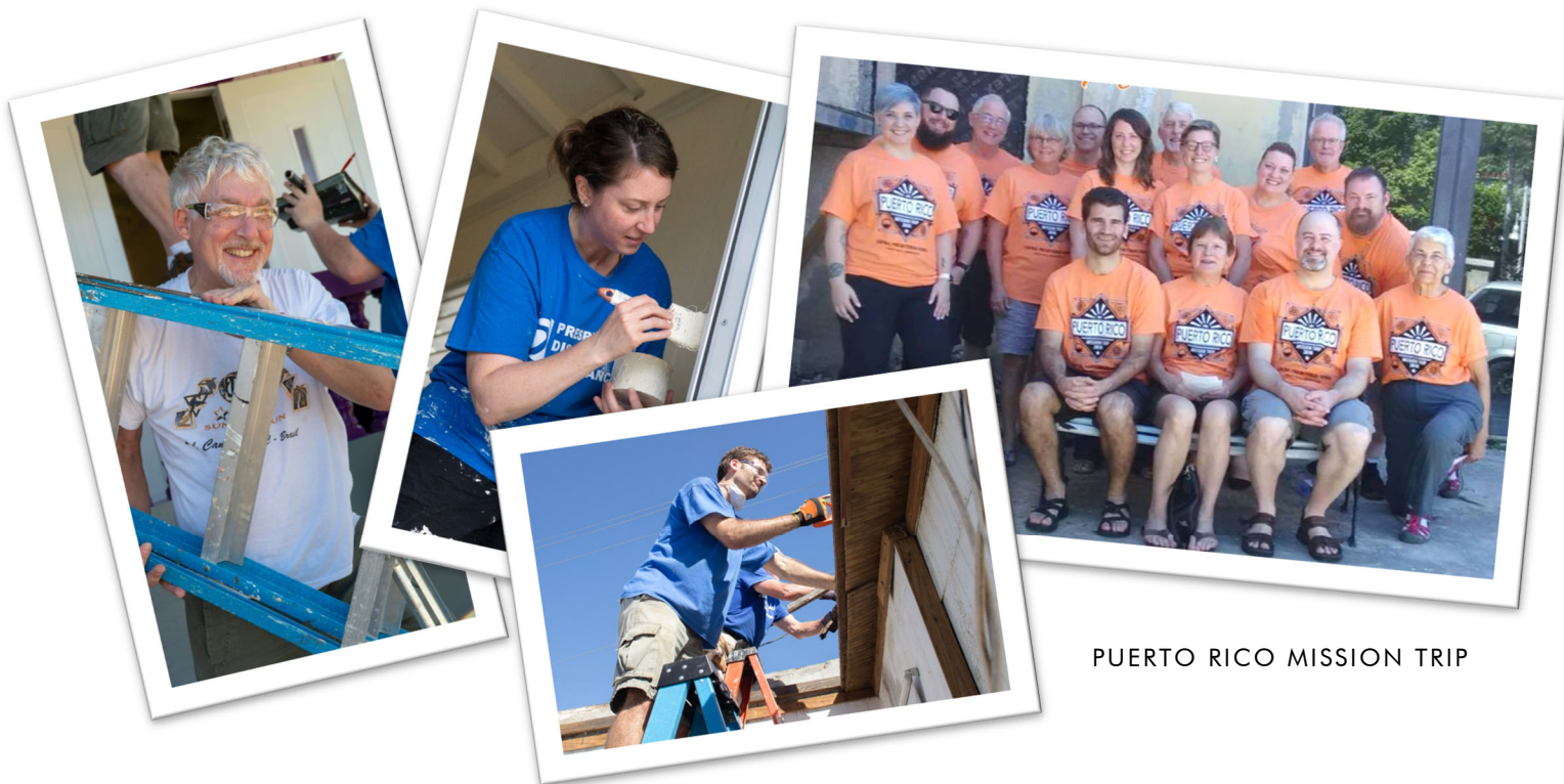
PUERTO RICO MISSION TRIP