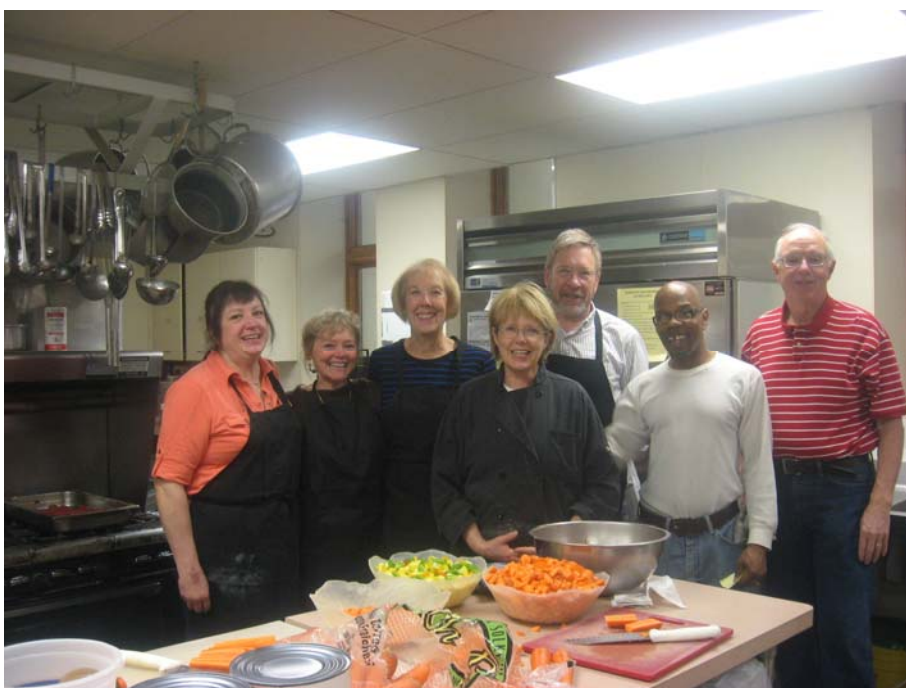
A typical Facebook posting about a Wednesday Lunch