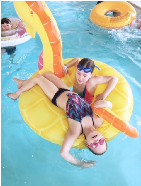
Fun at the beach! Okay, maybe it was an indoor pool with no sand, but the children and youth pool party in March was a fun way to celebrate the spring season!