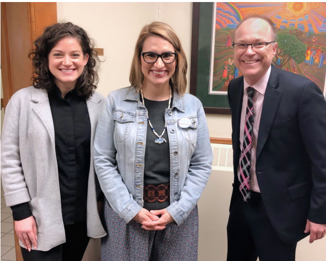
800+ advocates participated in the 2019 Homeless Day on the Hill, including Gov. Walz & Lt. Gov. Flanagan.

To learn more about the Minnesota Coalition for the Homeless or future Homeless Day on the Hill events, go to www.mnhomelesscoalition.org .