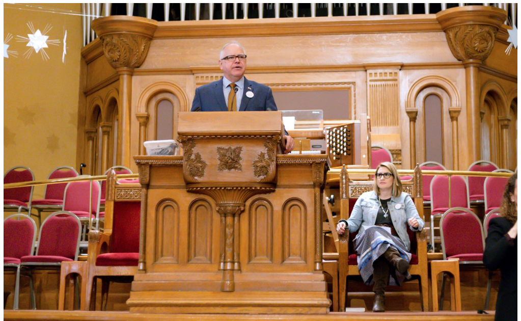
The first sitting governor to participate in Homeless Day on the Hill, Minnesota Gov. Tim Walz advocating for housing for all says “This is a moral imperative”.

March brought the biggest Homeless Day on the Hill in the history of the Minnesota Coalition for the Homeless.