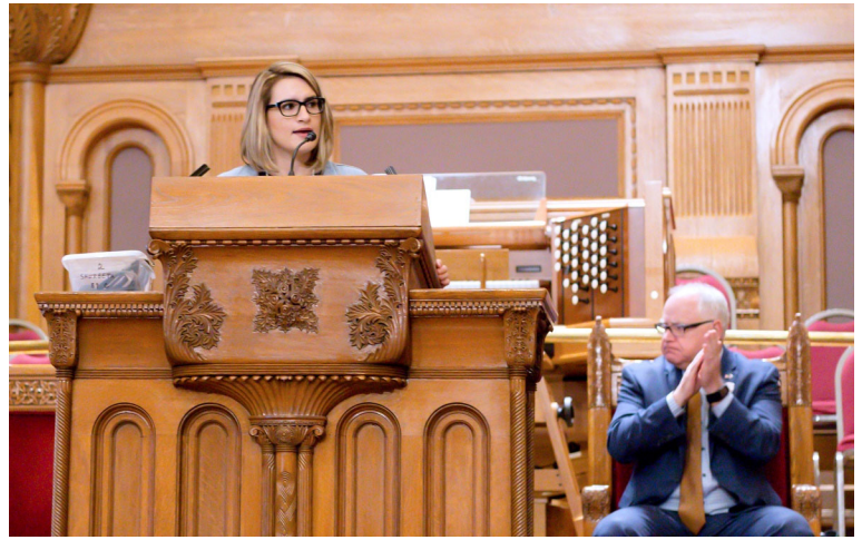
Lt. Gov. Peggy Flanagan speaks to those in the room experiencing homelessness "Your voice is the most important voice in this room."