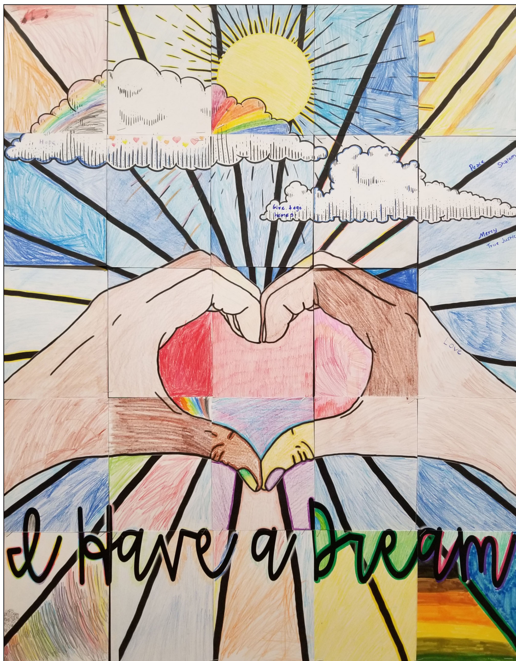
Collage by the children and youth of Central for Martin Luther King, Jr. day.

If we missed you, please send a note to office@centralforgood.org so we can update our records and share birthday wishes with you, too!