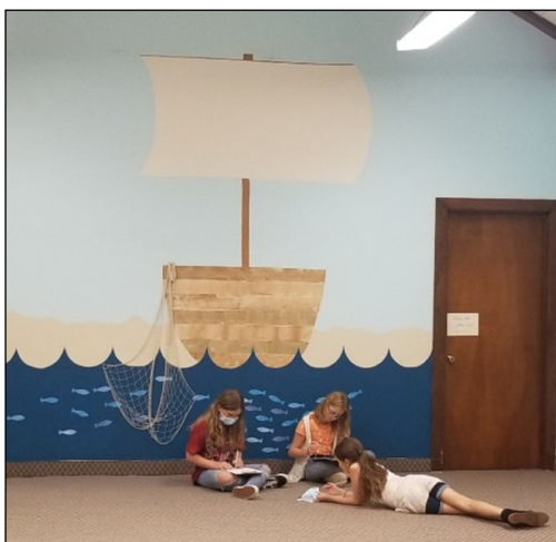
LifeBoat small group break-out.