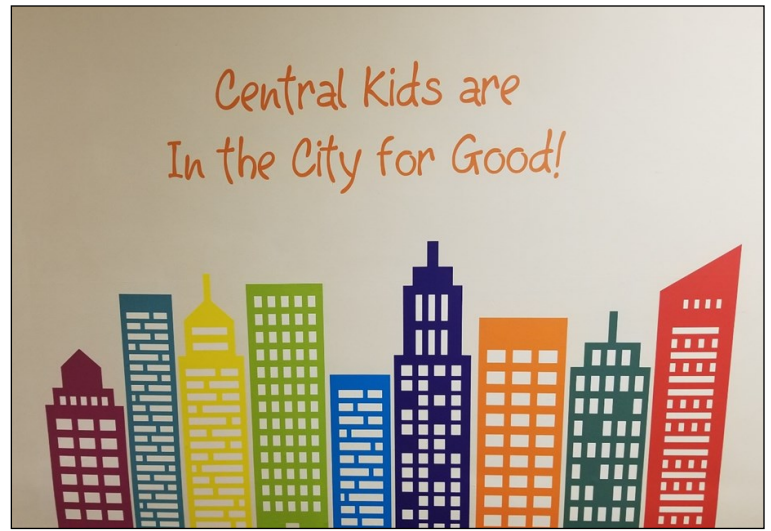
One of the new murals in our Children and Youth Ministry space upstairs.