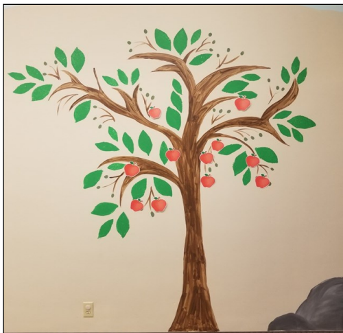
The olive tree that is growing in the Galilee Room doubled as the tree in the Garden of Eden during a recent lesson about Adam and Eve.