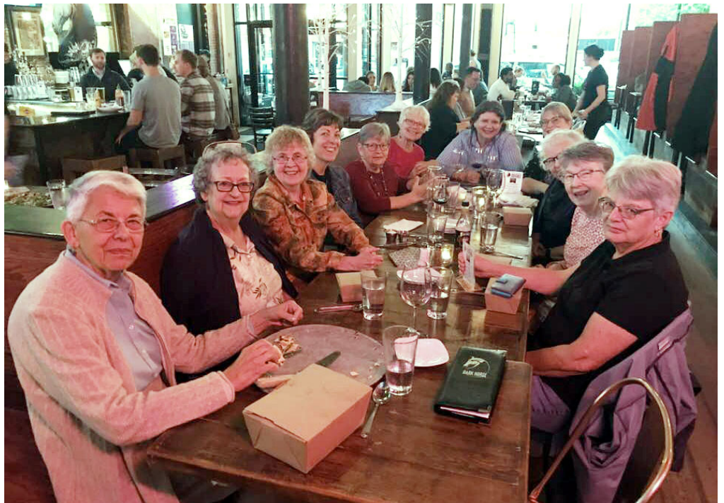
Women's Networking Group gathered at Dark Horse in September.