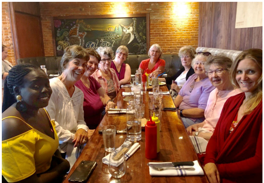
Women's Networking Group gathered at Parlour in Saint Paul for the August event.