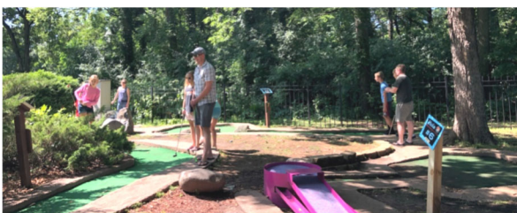
Another fun outing for Children & Youth families - this time to Como Park for mini golf!